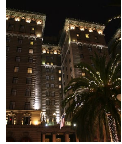
Westin St Francis

large institutional investors. While these meetings are conducted confidentially, we were pleased about the overall increase in the number of meetings we had this year compared with previous years around 50% more. This signifies to us that the market is becoming more aware of the Prima story and that LAG-3 is a molecule of interest to many.